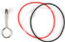
4. Colorful ring, hook