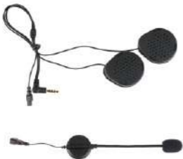
1. One Pair headset and microphone